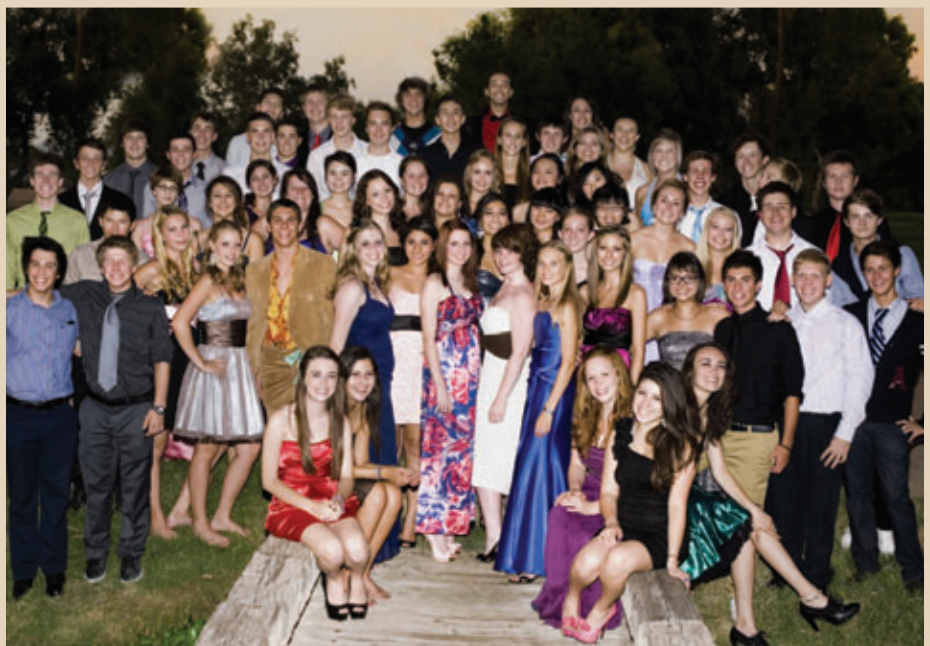
All Dressed Up...and Going to the Prom: The Tempe Sister City Prom became a tradition in 1999 as the summer "ambassadors" get dressed up for a night of dancing and fun. The event is sponsored by the TSC Youth organization and held at Shalimar Country Club. Special thanks to the Cinderella Affair which allowed the girls to borrow the "perfect dress" to wear.