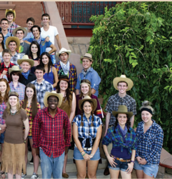
tions gather together as their Tempe Sister City summer activities Welcome Dinner was held on the Arizona State University campus at Old Western, of course!