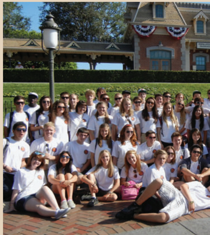
Disneyland...the experience everyone should enjoy at least once! The 2011 summer ambassadors stepped off their double-decker bus into the magical place called Disneyland and enjoyed another adventure.