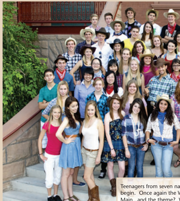
Teenagers from seven na begin. Once again the V Main...and the theme? V