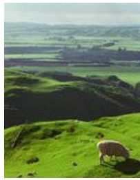
Lower Hutt , New Zealand