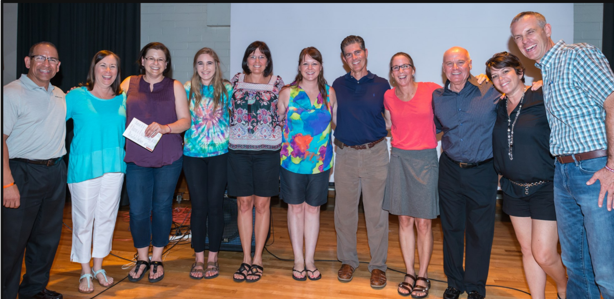
Above: 2015 Student Ambassadors celebrate at the Welcome Dinner at Old Main, ASU.