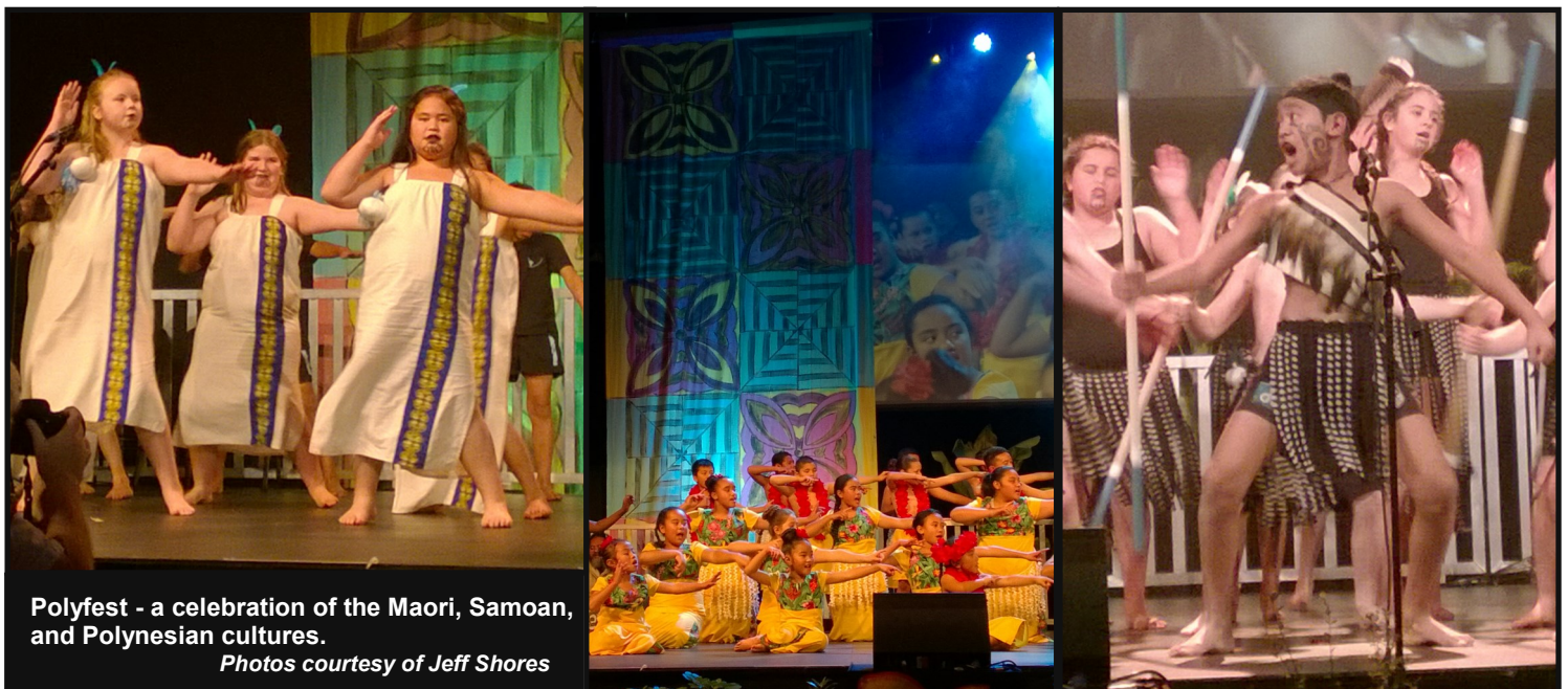
Polyfest - a celebration of the Maori, Samoan, and Polynesian cultures.