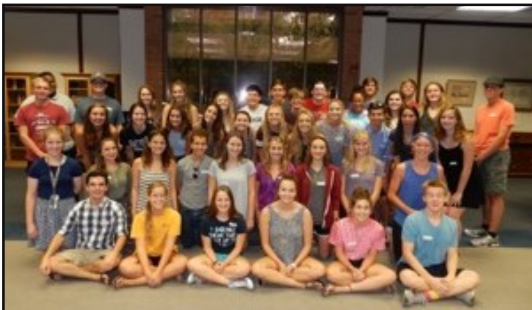
First meeting of the 2015-2016 Youth Group

The Youth Group is open to all Tempe citizens ages 14-18 years old. It is a philanthropy-based group that also concentrates upon developing leadership and public speaking opportunities.